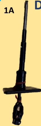
1A Dost Lower Assy.