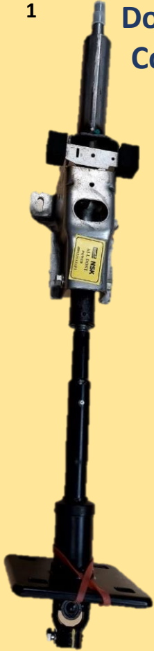
1 Dost - Steering Column Assy.