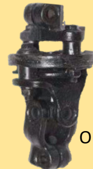
1F Dost - Coupling Alone